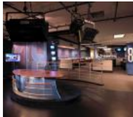
WJLA TV Broadcast Facility

WJLA-TV Broadcast Facility: Arlington, Virginia