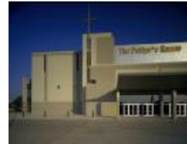
The Potter's House