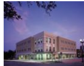
Park Cities Medical Plaza